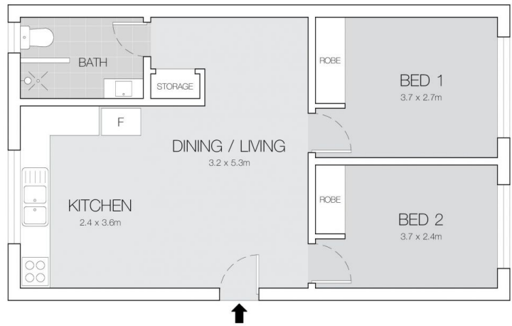
ELEVATED GROUND LEVEL